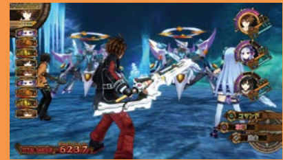
Japanese screenshots featured